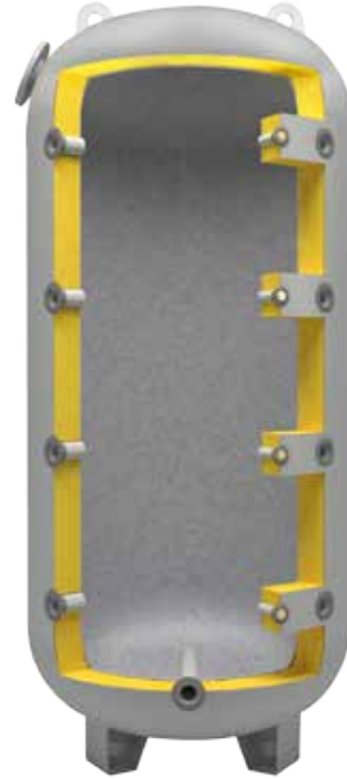
Side Section View